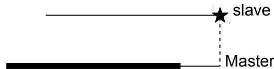
Figure 3.1.5-1: Projection of a node slave apart from a mesh Master

In certain situations, it can be necessary to extend in a fictitious way the meshes of surface Master. Let us take the case of the contact in 2D on Figure 3.1.5-1 (surfaces of contact are thus segments), one places oneself on the edge of the surface of contact. The projection of a node slave falls apart from surface Master.